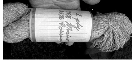
Betty's son's hand spun 'possum and merino yarn.