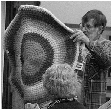
Rusty's crocheted alpaca rug – Just Toasty!