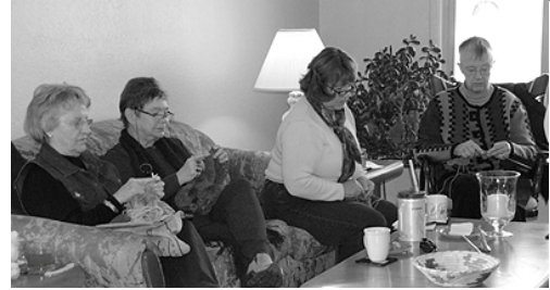
bunches of knitters . . .